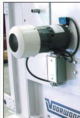
KNIFE BAR OSCILLATOR Extends life of razor edges.