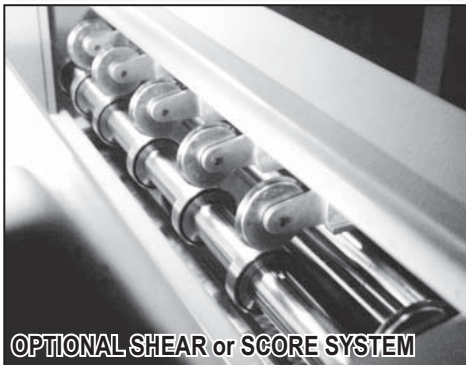
OPTIONAL SHEAR or SCORE SYSTEM Alternate slitting systems that are available in a rotary shear (shown above) or score system. Both systems are individually powered and are controlled by a relational speed feedback system.