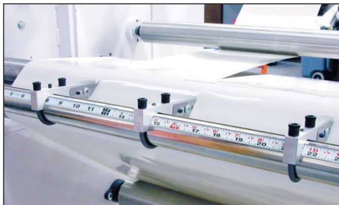
QUICK RAZOR SETUP Setup is done quickly and efficiently with fully adjustable slitter knives. The calibrated bar uses 36 holders.