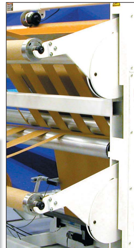
CANTILEVERED ARBOR The cantilevered arbor & swing-away bearings makes for fast core setup and stripping.

Manufacturers of Machines for Film Laminating and Converting